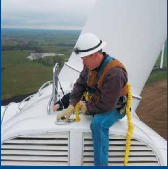
U.S. SCIENTISTS AND ECONOMISTS' CALL FOR SWIFT AND DEEP CUTS IN GREENHOUSE GAS EMISSIONS